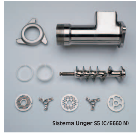
Sistema Unger S5 (C/E660 N)